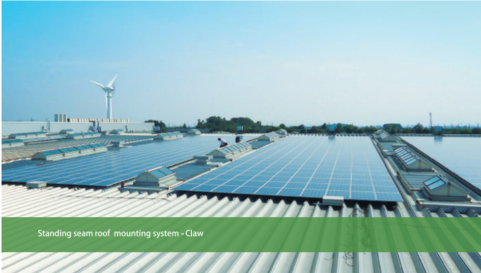
Standing seam roof mounting system - Claw

Headache-free mounting solution for metal roofs with standing seam design